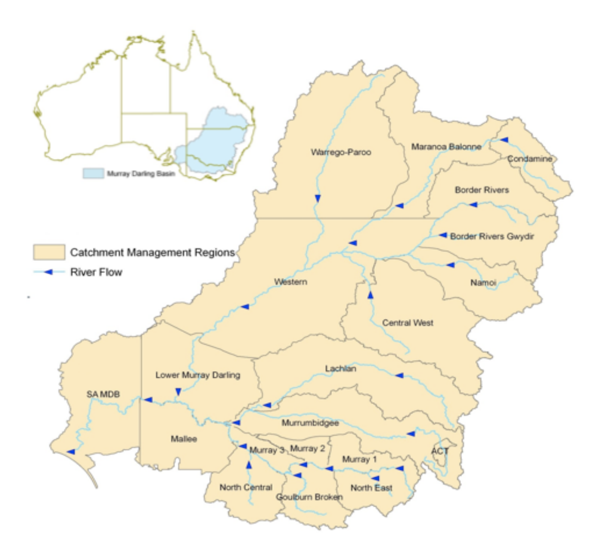
Annual inflows into the Basin since the 1890s have averaged 27 000 GL, of which runoff into streams contributed about 25 000 GL, accessions to groundwater

Figure 1: Murray–Darling Basin, Australia