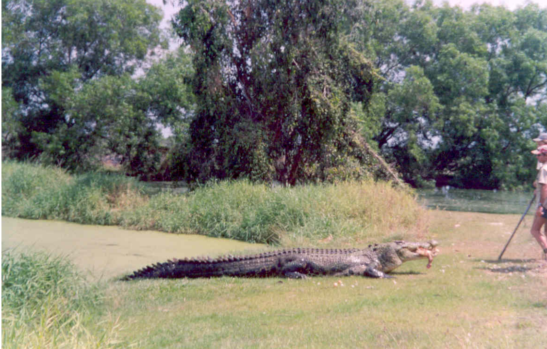
Figure 3: Keepers feeding a fowl to a crocodile at Darwin Crocodile Farm in NT to entertain tourists. The tourists are watching behind an iron-mesh fence but cannot be seen in this photograph.

Farm stocks of crocodiles are replenished from two sources: (1) eggs laid by brood stock on the farm which are hatched and raised to 2 or 3 years old of age before processing, and (2) eggs collected from landholdings for which landholders have been allocated a harvest quota by the PWCNT, and to some extent hatchlings, juveniles and occasionally adults harvested from the same source. The major source of eggs for restocking farms is ranching rather than eggs laid on crocodile farms. The quantity of crocodile eggs and adults harvested by some of the farms surveyed are shown in Table 1. Present annual quotas for wild harvests are 25,000 eggs and 575 adult crocodiles (see PWCNT, undated).