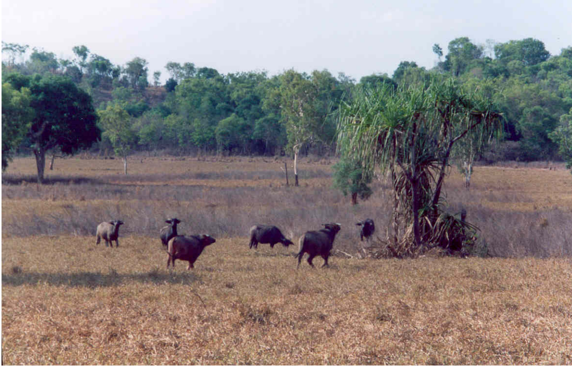
Figure 4: These wild (feral) Asian buffaloes ( Bubalus bubalis ) were seen near the Mary River in the Northern Territory in an area where saltwater crocodiles are abundant. There are plenty of nesting materials for crocodiles in this vicinity. However, the manager of the ‘Melaleuca’ cattle property located downstream reported that while crocodiles occur on this property, they do not nest because of lack of nesting materials.