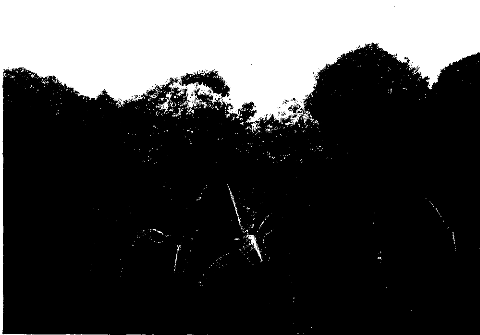
Figure 1d: A ladang after cinnamon trees reach an age of 12 years or more. This could be called a monospice agroforest, with a negligible number of banana and cassava planted on the edge.