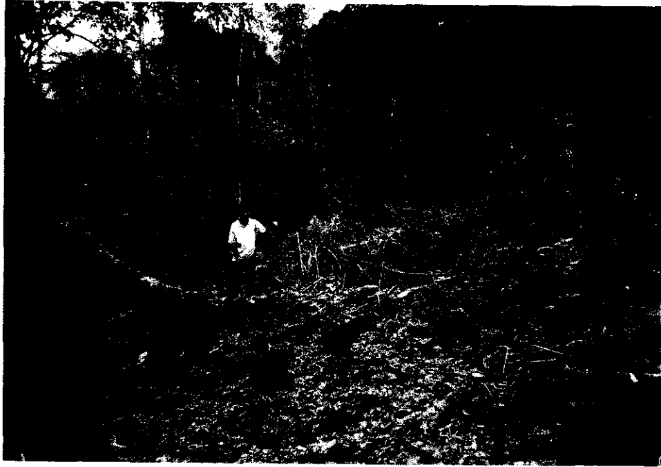
Figure 1a A new ladang at the forest frontier, with damaged forests shown in the background. The farmer is a new, young, anak ladang of 18 years of age.