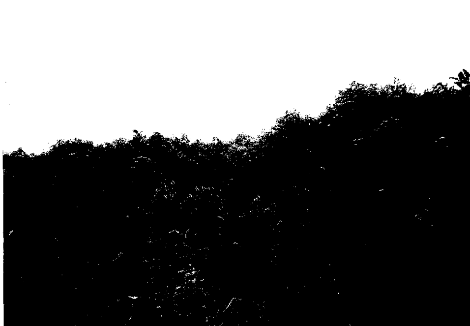
Figure 1b: Regrowth during the drying period.