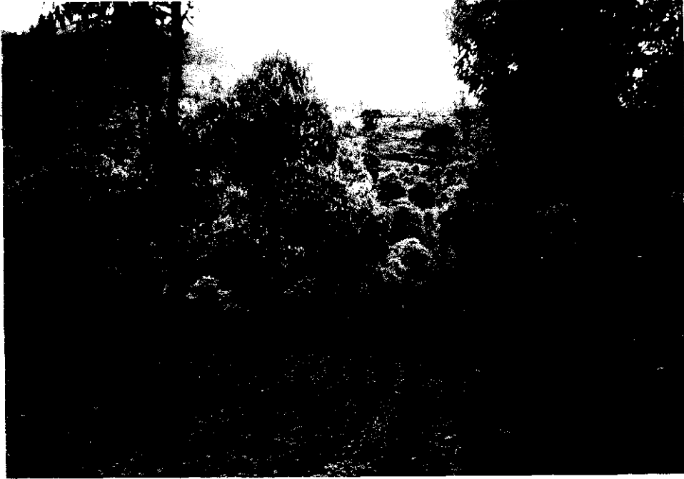
Figure 1c: A ladang after 5 years of plantation, with potato and cinnamon as the main crops. The ladang is on sloping land.