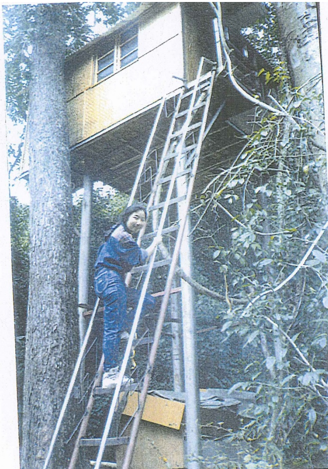
Photograph 8: Treetop hotel at San-Ca-He for viewing elephants. It is a favourite bathing spot of the elephants. Salt is sometimes distributed nearby to entice the elephants to visit the area.