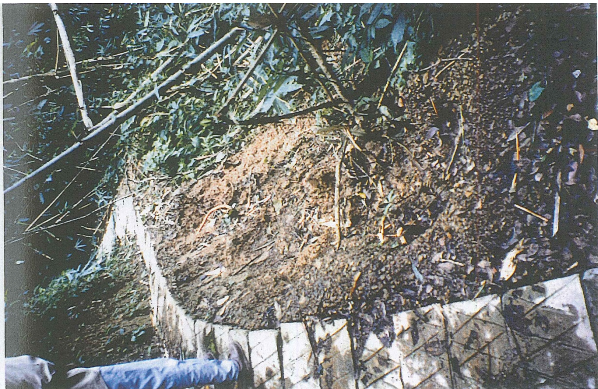
Photograph 6: Damage at the side of a walking path at San-Ca-He caused by elephants sliding down the embankment. Eventually the path is likely to be undermined.