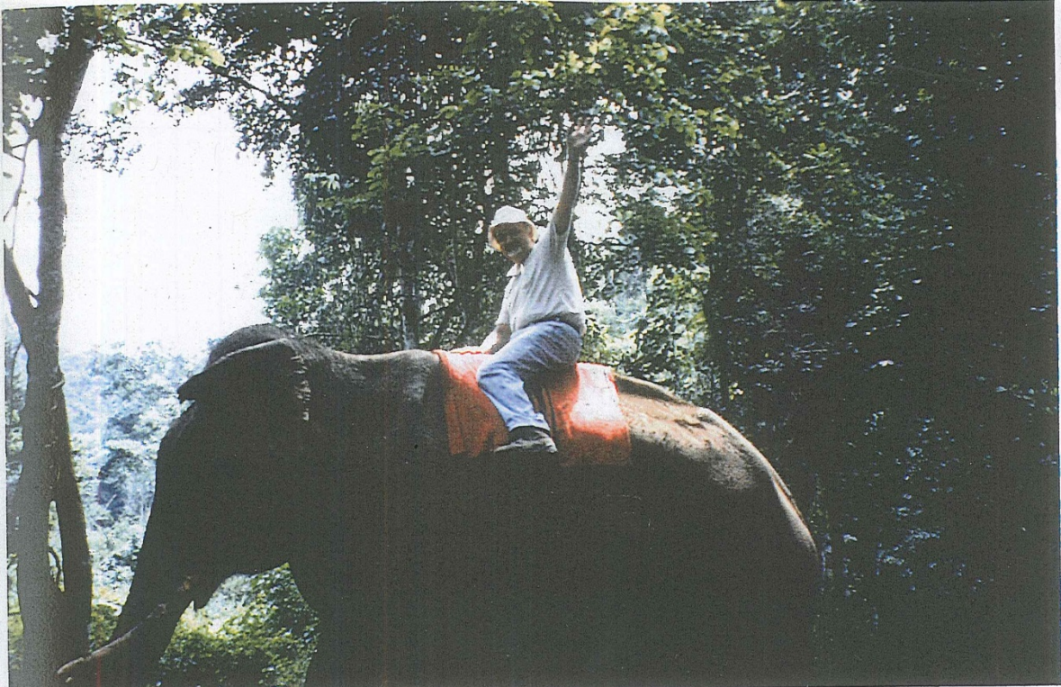
Photograph 5: Domestic elephant at San-Ca-He, October 1994 with one of the authors mounted on it.