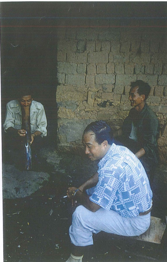
Photograph 2: Leaders in the village of Zhong Tian Ba discuss with the authors the problem which they encounter with wildlife from the nearby Mengyang subreserve.