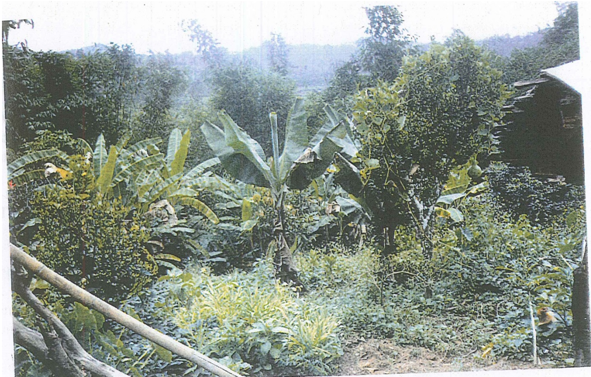
Photograph 7: Banana trees in Zhong Tian Ba village. Such trees are a favourite food of marauding elephants.