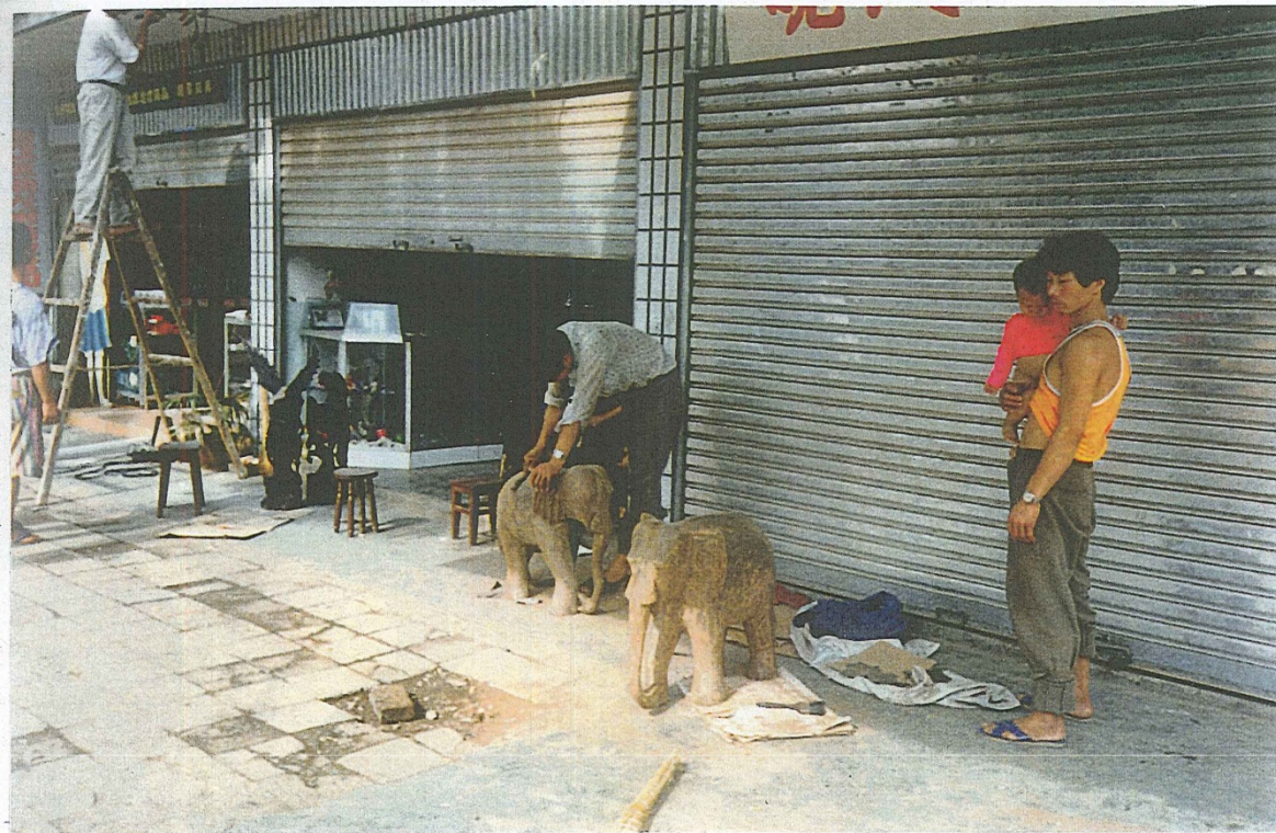
Photograph 1: Carving wooden elephants on the footpath in Jinghong, the capital of Xishuangbanna Prefecture. The carvings are for sale to tourists