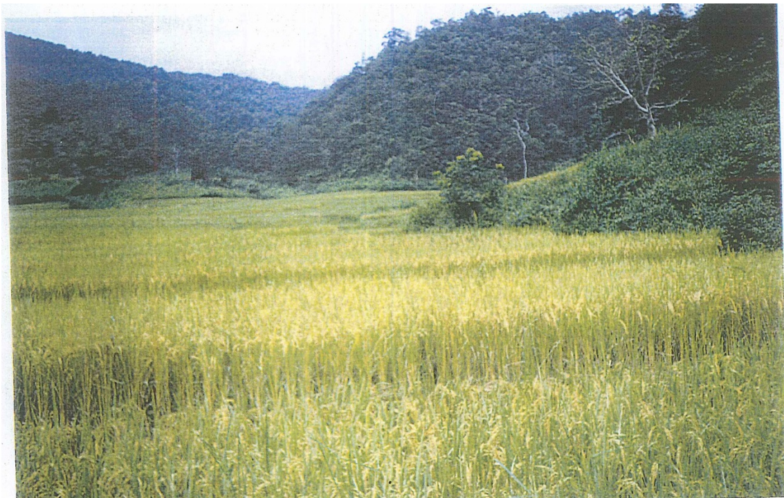
Photograph 4: Ripening rice crop in the valley near Zhong Tian Ba with Mengyang subreserve visible in the background. Rice has been eaten by elephants in the past and villagers stay up and light fires to frighten them away when necessary.